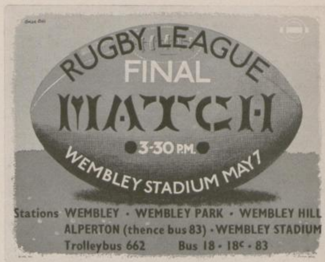
Entwurf BRIAN ROBB Design

On looking at these new London Transport posters which practically without exception are recent productions, and on realizing that they represent but a very small selection of the infinitely larger poster production of one single English firm, one may be justified in concluding that the demand for them is very considerable, and that the public taste decidedly favours posters in England. Moreover, these new posters undoubtedly show that not only quantity but quality is demanded and are themselves excellent examples of the high artistic standard reached in English poster production today. Obviously England has at her disposal rich and apparently inexhaustible reserves of artistic talent, since there is a quick succession of new and highly gifted artists producing work of a very high order. This alone can explain the amazing abundance of original and striking work done