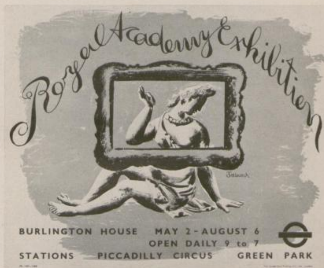
Entwurf HANS FEIBUSCH Design

On looking at these new London Transport posters which practically without exception are recent productions, and on realizing that they represent but a very small selection of the infinitely larger poster production of one single English firm, one may be justified in concluding that the demand for them is very considerable, and that the public taste decidedly favours posters in England. Moreover, these new posters undoubtedly show that not only quantity but quality is demanded and are themselves excellent examples of the high artistic standard reached in English poster production today. Obviously England has at her disposal rich and apparently inexhaustible reserves of artistic talent, since there is a quick succession of new and highly gifted artists producing work of a very high order. This alone can explain the amazing abundance of original and striking work done