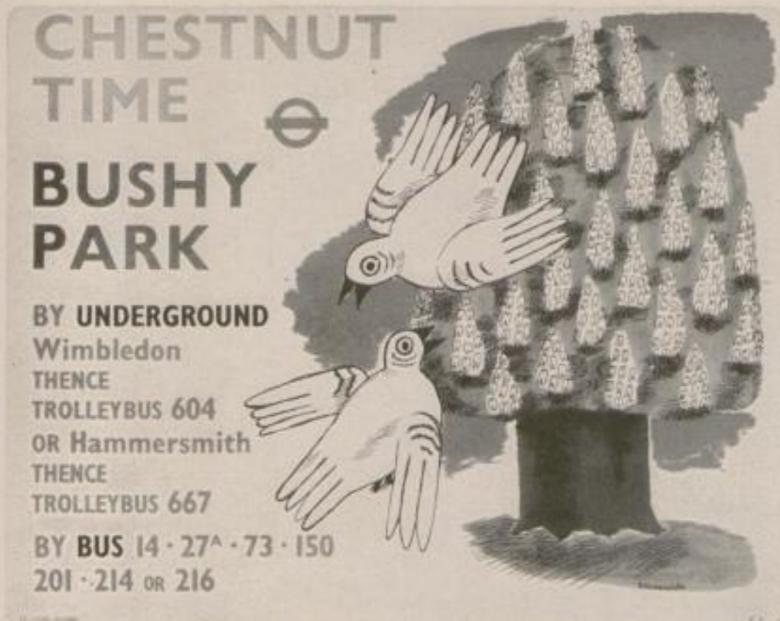
Entwurf BETTY SWANWICK Design