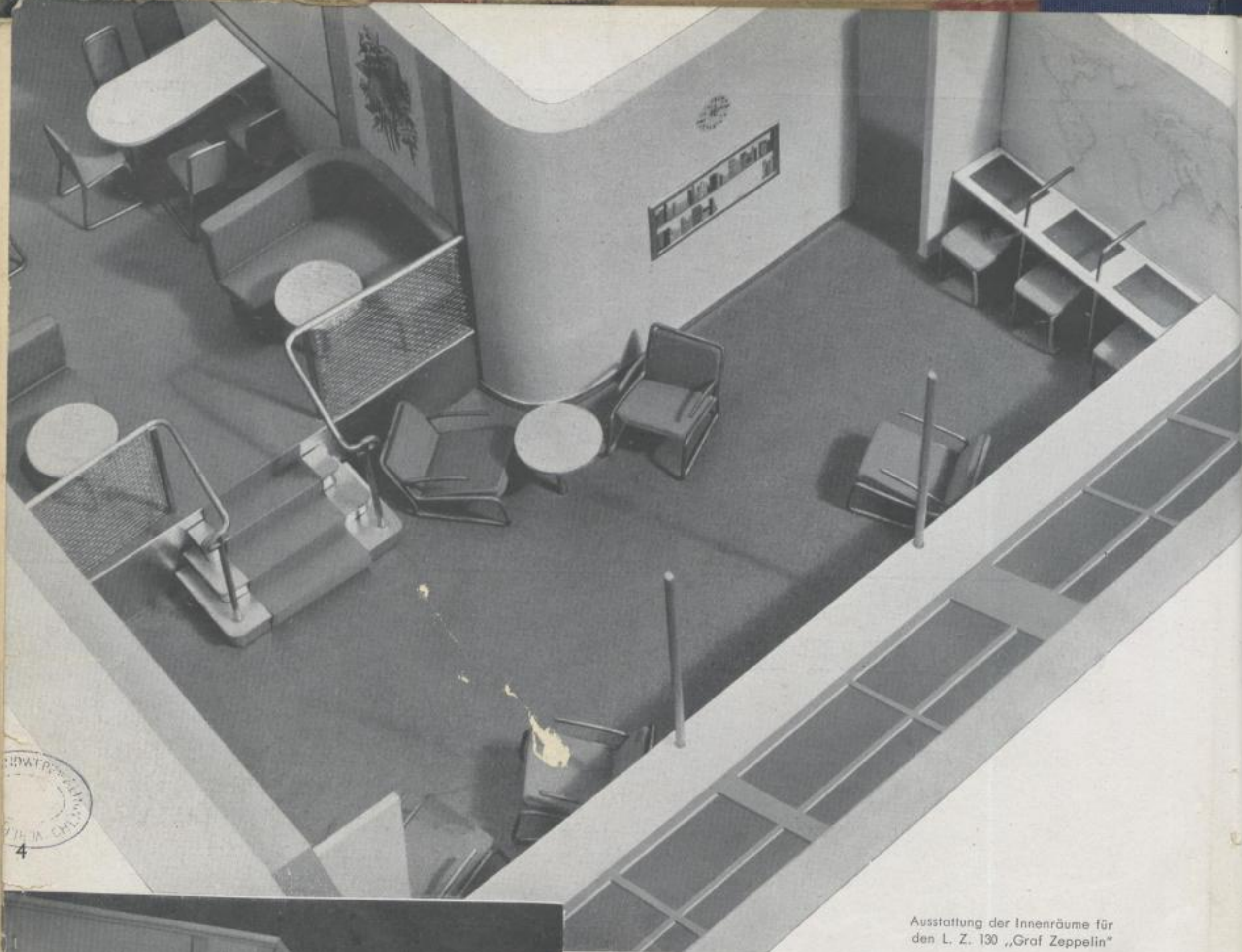
Ausstattung der Innenräume für den L. Z. 130 „Graf Zeppelin“

Interior decoration for the airship L. Z. 130 "Graf Zeppelin"