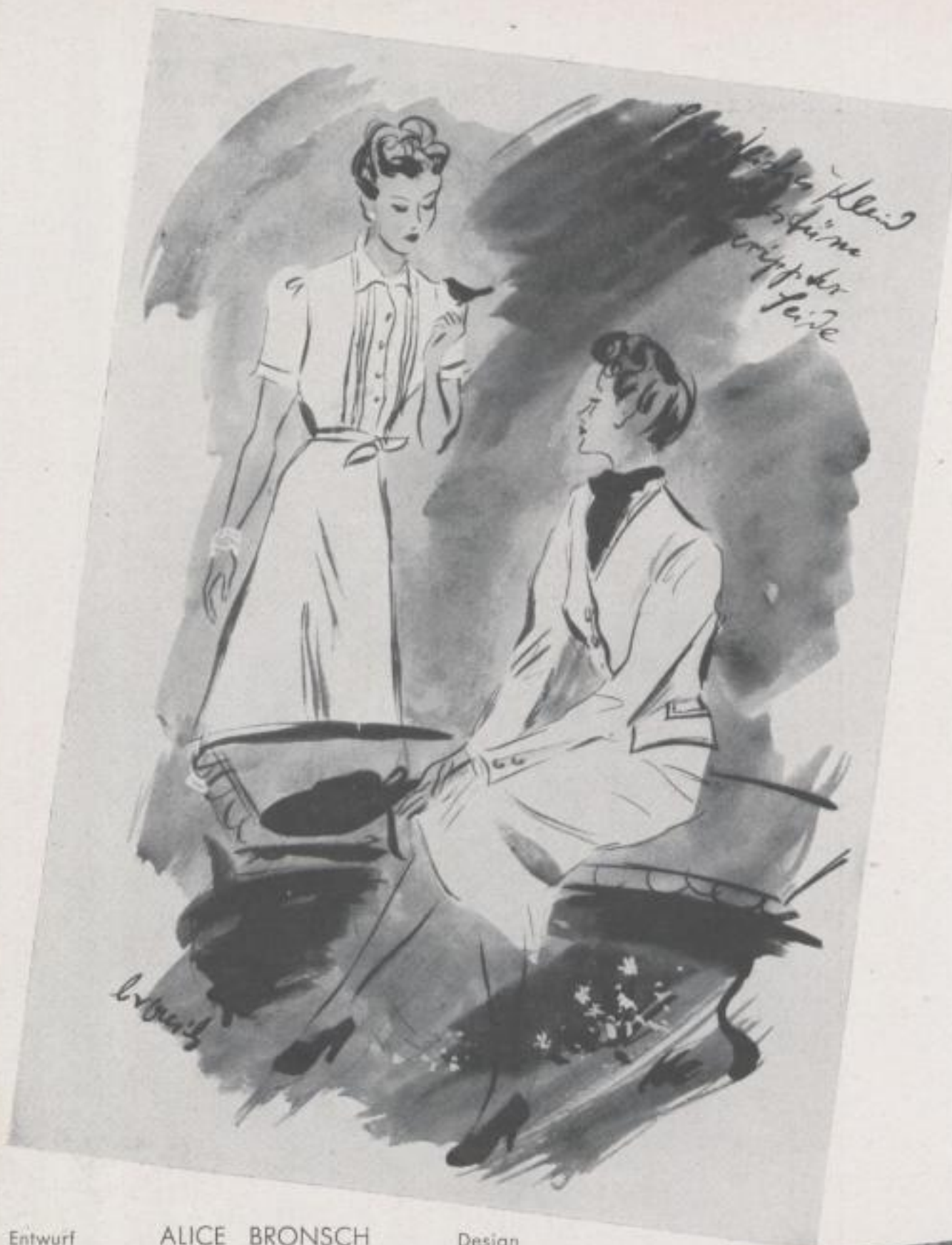
Entwurf ALICE BRONSCH Design