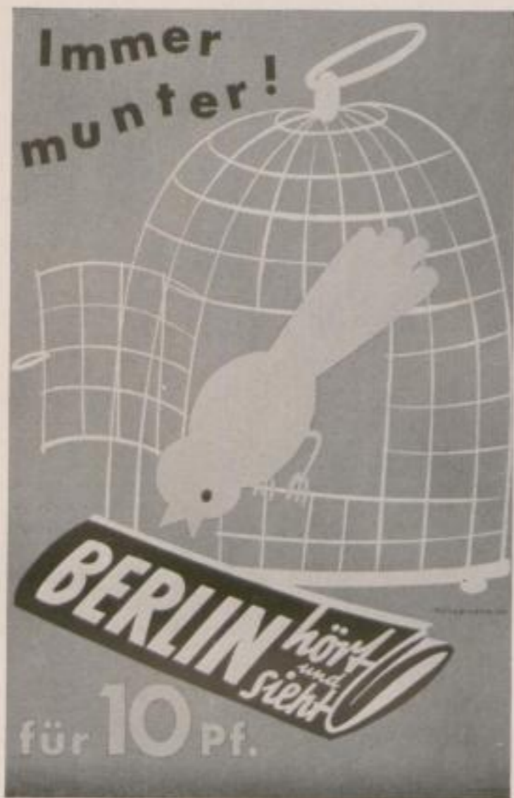
Posters for periodicals