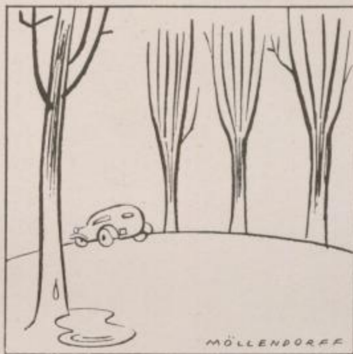
"Reverting to Type" Spoiled Sammy—sunday trip to his favourite tree