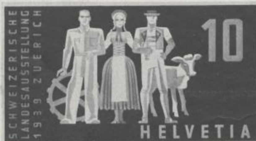
Stamps for an exhibition