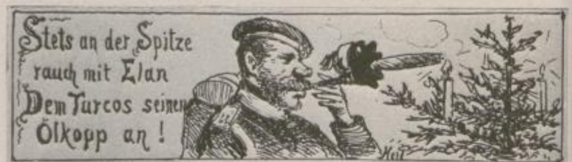
Packung für Zigarrenspitzen Package for cigar-holders Entwurf GUSTAV HEIL Design