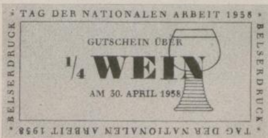
Gutscheine Promissory notes