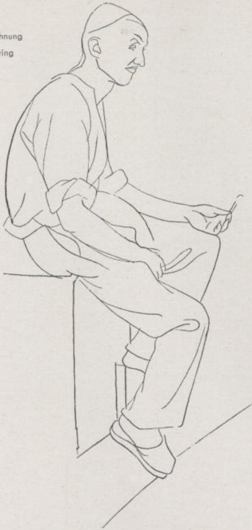
Bleistiftzeichnung Pencil drawing

For centuries creative art cultivated for its own sake has enriched applied art. We need only recall to mind Holbein's and Dürer's series of illustrations and drawing copies. To-day we can single out as an instance of this the work of Joachim Lutz, a Mannheim artist whose talents have matured within a decade. A travelled man, he is familiar with the scenery round the Mediterranean, the vally of the Neckar, the Erzgebirge, Dutch towns and North Sea dunes, all of which he depicts in drawings and aquarelles soft and delicate in their colouring at first but displaying later on a more austere quality. The gorgeous splendour of summer flowers is as familiar to him as the sweeping lines of human faces and animal physiognomies. He has always allowed the concept of his picture to determine the medium of expression whether it be pen and pencil, silver-point, wood engraving, brush pencilling and the vigorous but transparent painting in water-colours, or red chalk and charcoal. To say, however, Lutz is technically proficient would be to give but a