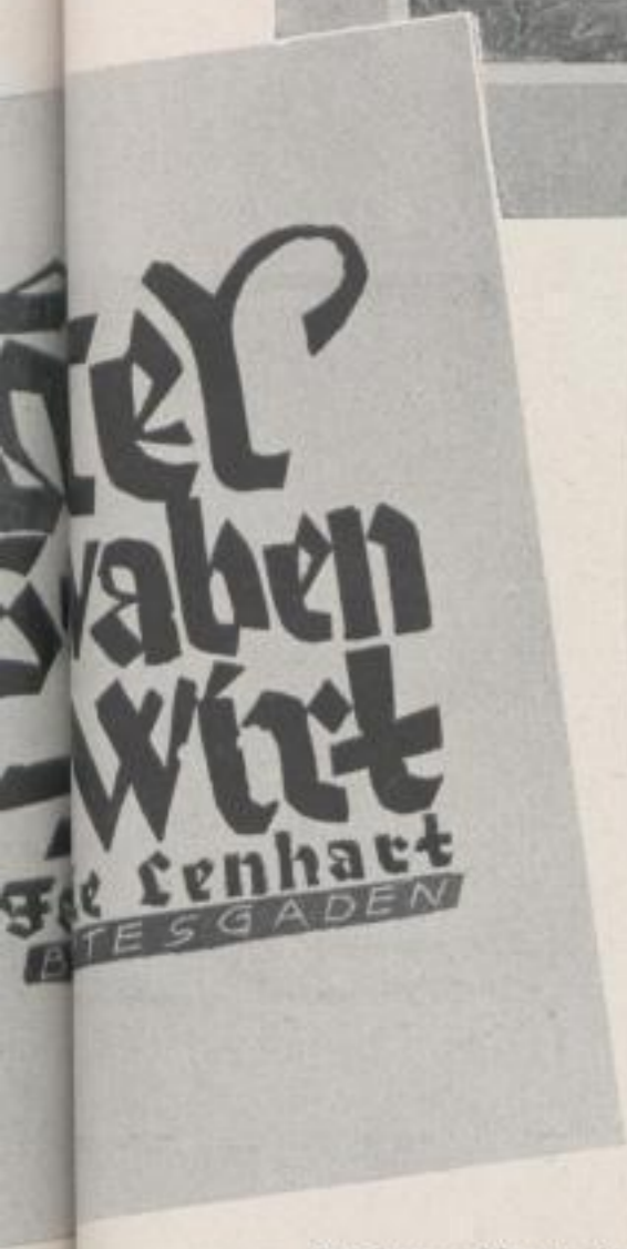
Glückwunschkarte eines Hotels Seasonable Greetings of a Hotel