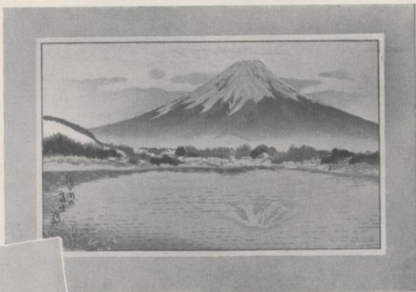
Card of a Type-Foundry

Some of our readers will doubtless be somewhat astonished to find in a Spring issue this series of business cards similar to those which for the last ten years or so business firms have been in the habit of sending to their clients and friends at Christmastide and New Year. Our purpose is to draw the attention of advertising artists to the noteworthy competition for acquiring card-designs which has been