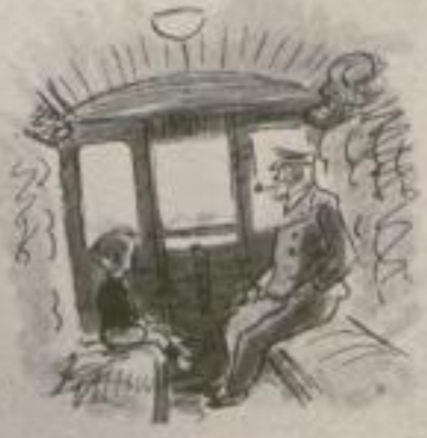
„Der kleine Tim und der tapfere Kapitän“ Text und Illustrationen von EDWARD ARDIZZONE

One day the old boatman told Tim that he was going out in his motor boat to a steamer which was anchored some way out. Would Tim like to come, too? Tim was overjoyed. The boatman went on to say that the Captain of the steamer was a friend of his, and, as the steamer was about to sail, he wanted to say good-bye to him. Tim helped the boatman to launch the boat and off they went.