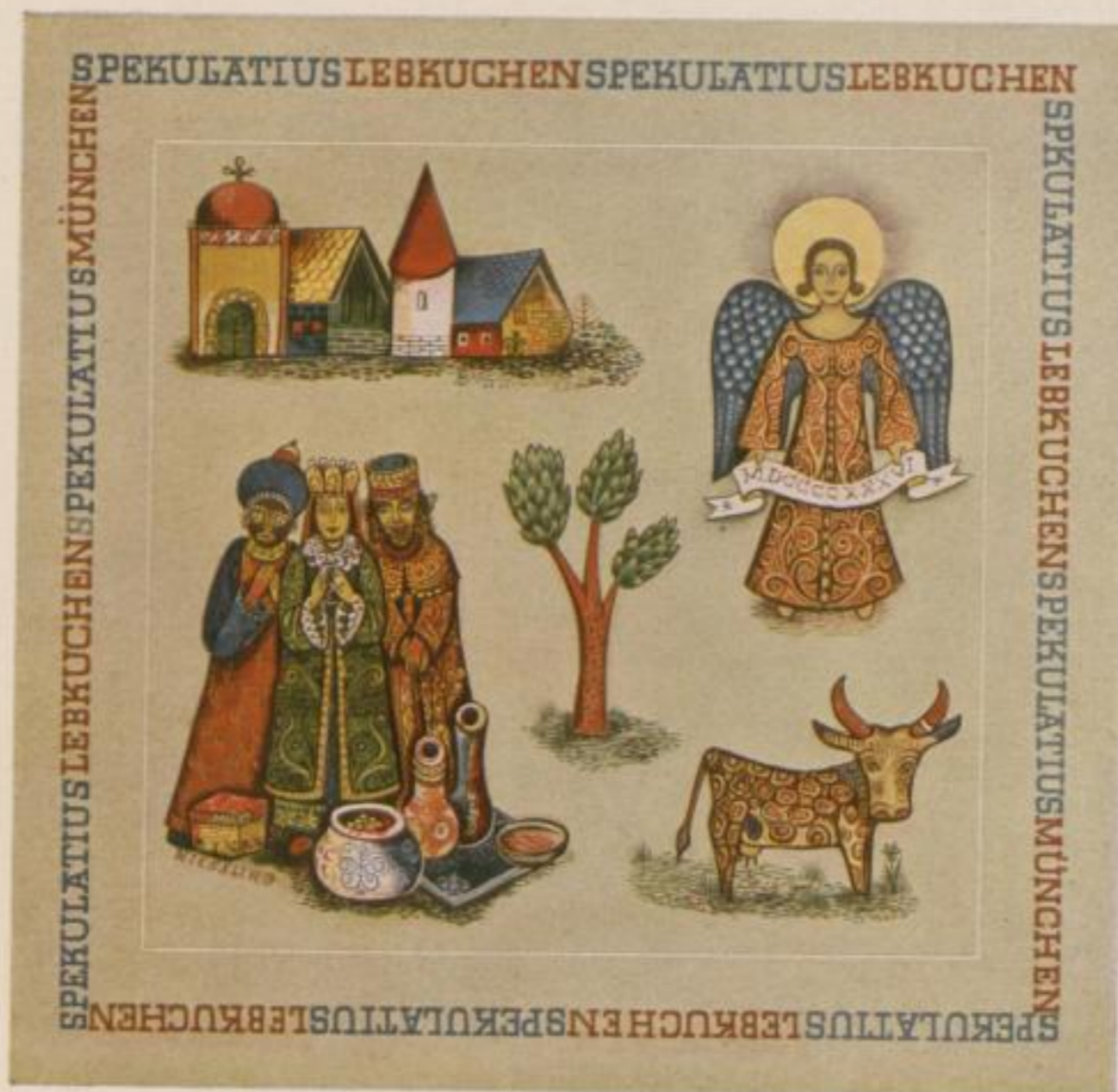
Lebkuchen-Packung Ginger-bread package