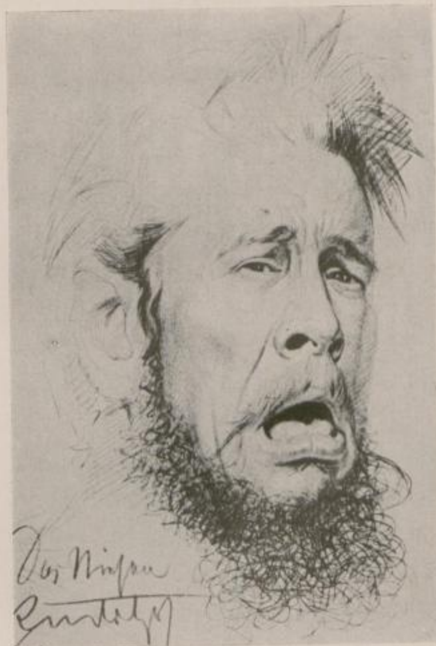
Niesen — mit unangenehmer Empfindung Sneezing—an unpleasant sensation