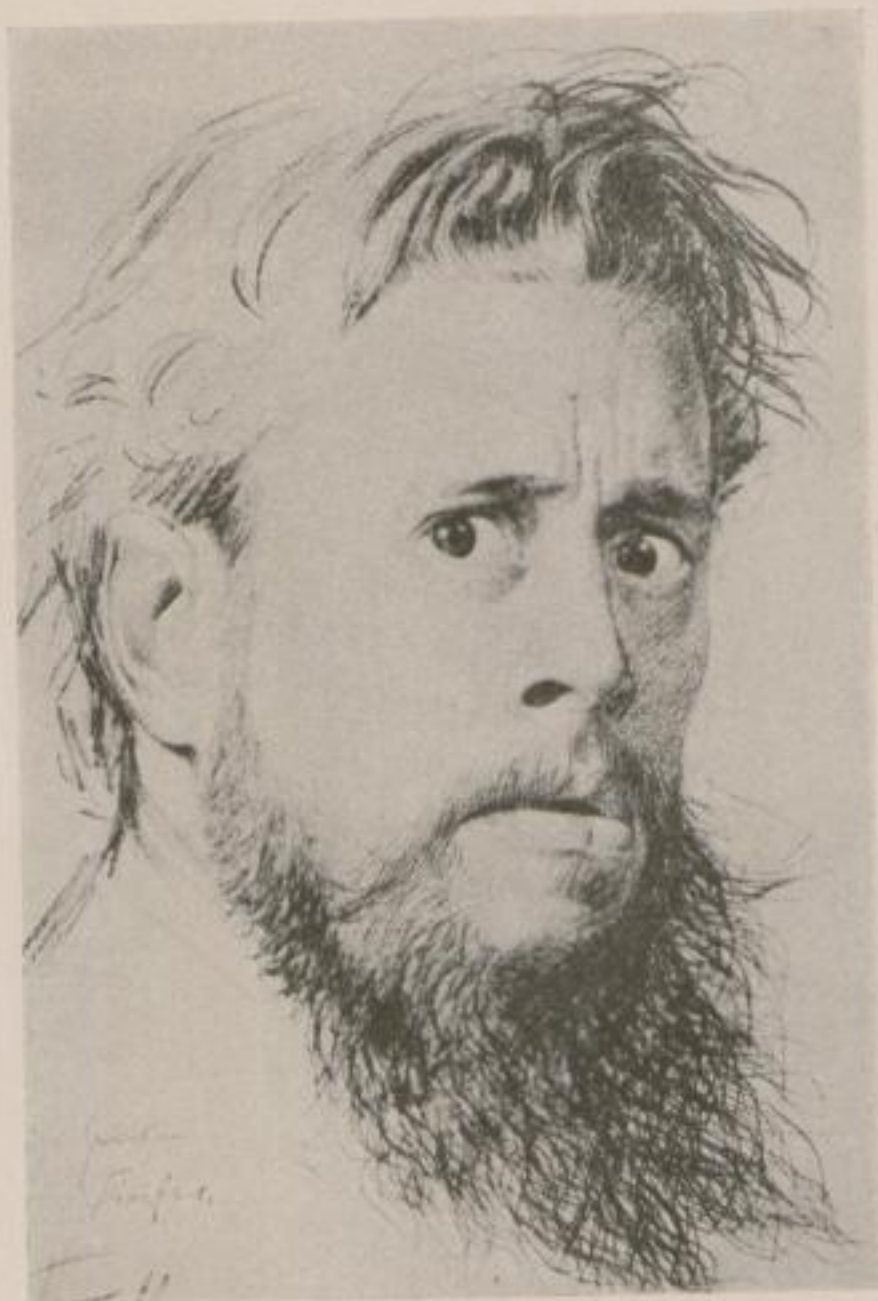
Furcht — das böse Gewissen Fear—bad conscience