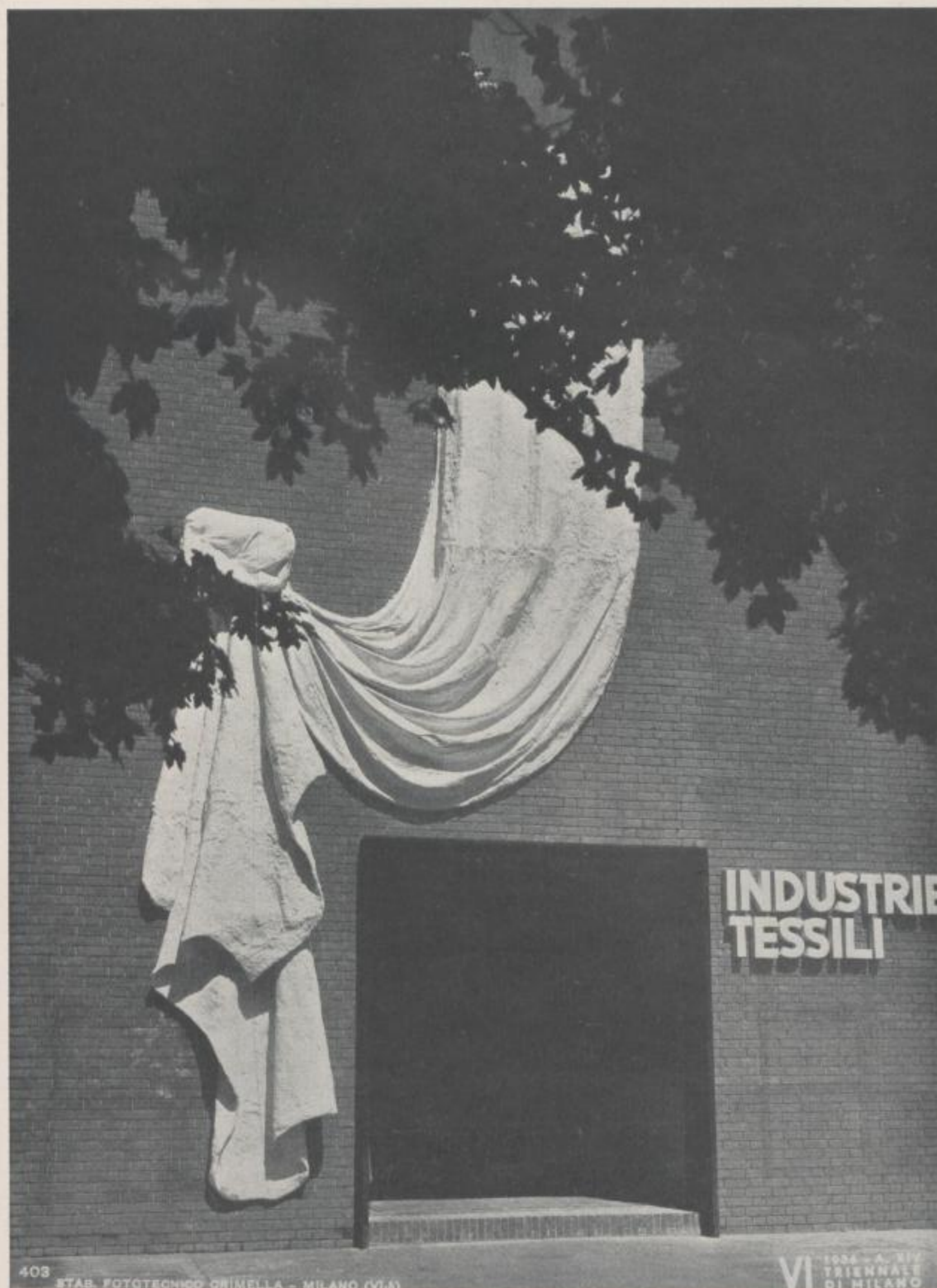
Eingang zur Textil-Ausstellung Mailand 1936