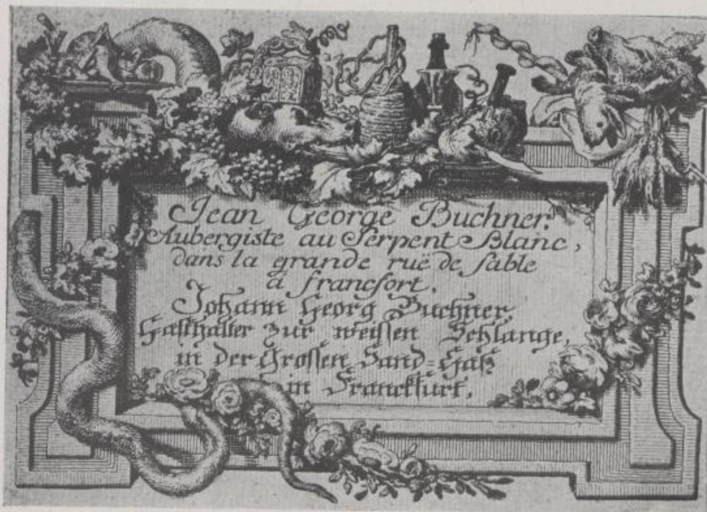
Adress-Card of a Frankfurt Hostelry. About 1780

As early as the latter half of the sixteenth century traveling became increasingly popular in Germany, and after the stress of the Thirty Years' War it had a still greater vogue. The reason for such a development is to be sought in the fact that Germany was the first country in which the Post Office undertook the conveyance of passengers from place to place. Simultaneously with this development an improvement in the standard of inns could be noted, particularly in important centres fre-