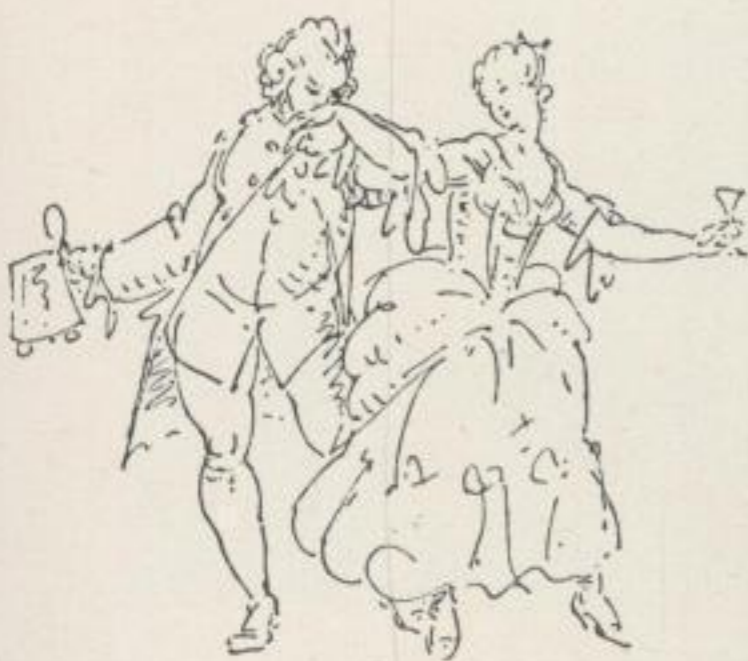
Buchumschläge und Vignette Book-jackets and vignettes