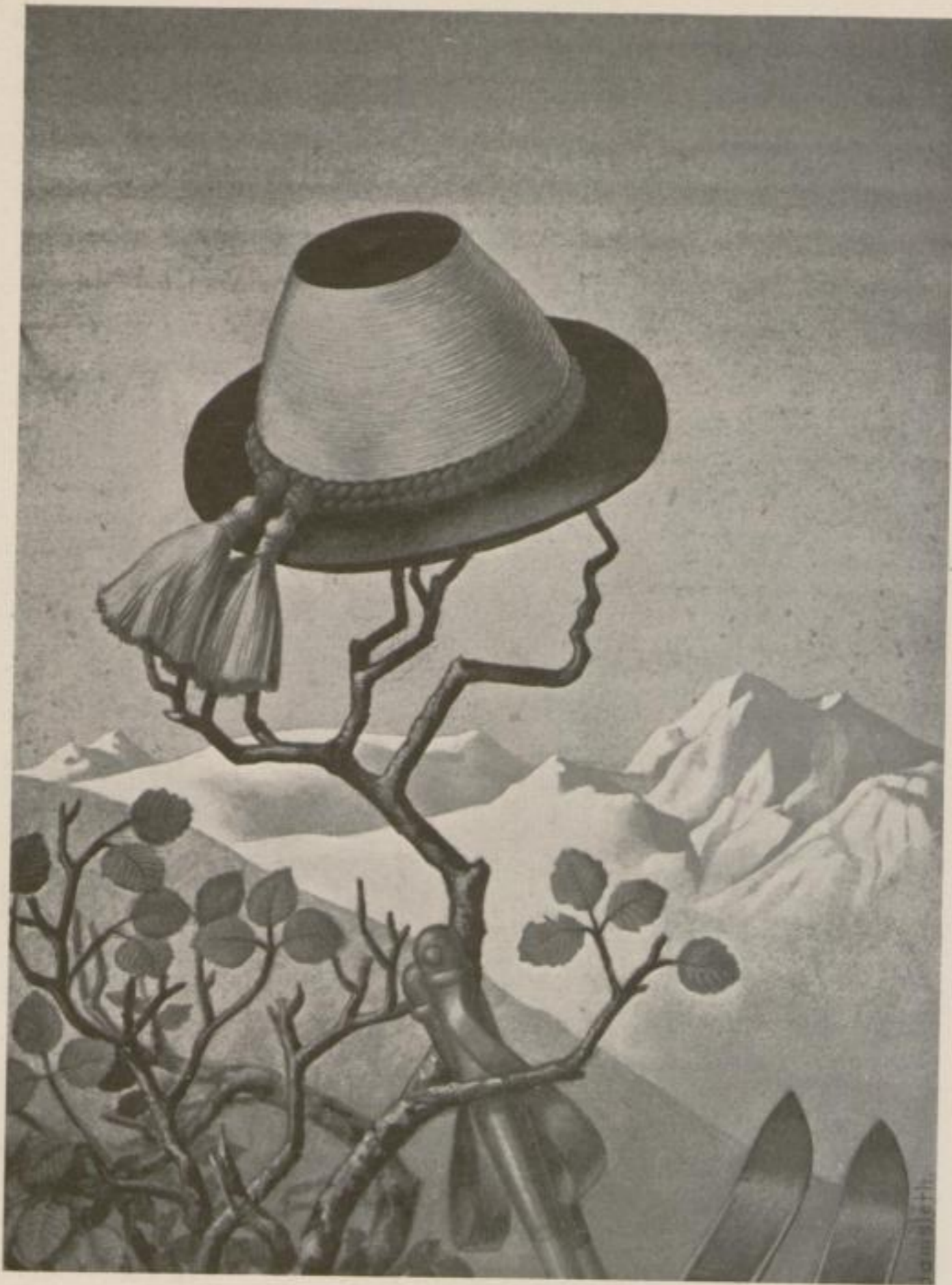
Zeitschriftentitel Periodical Cover