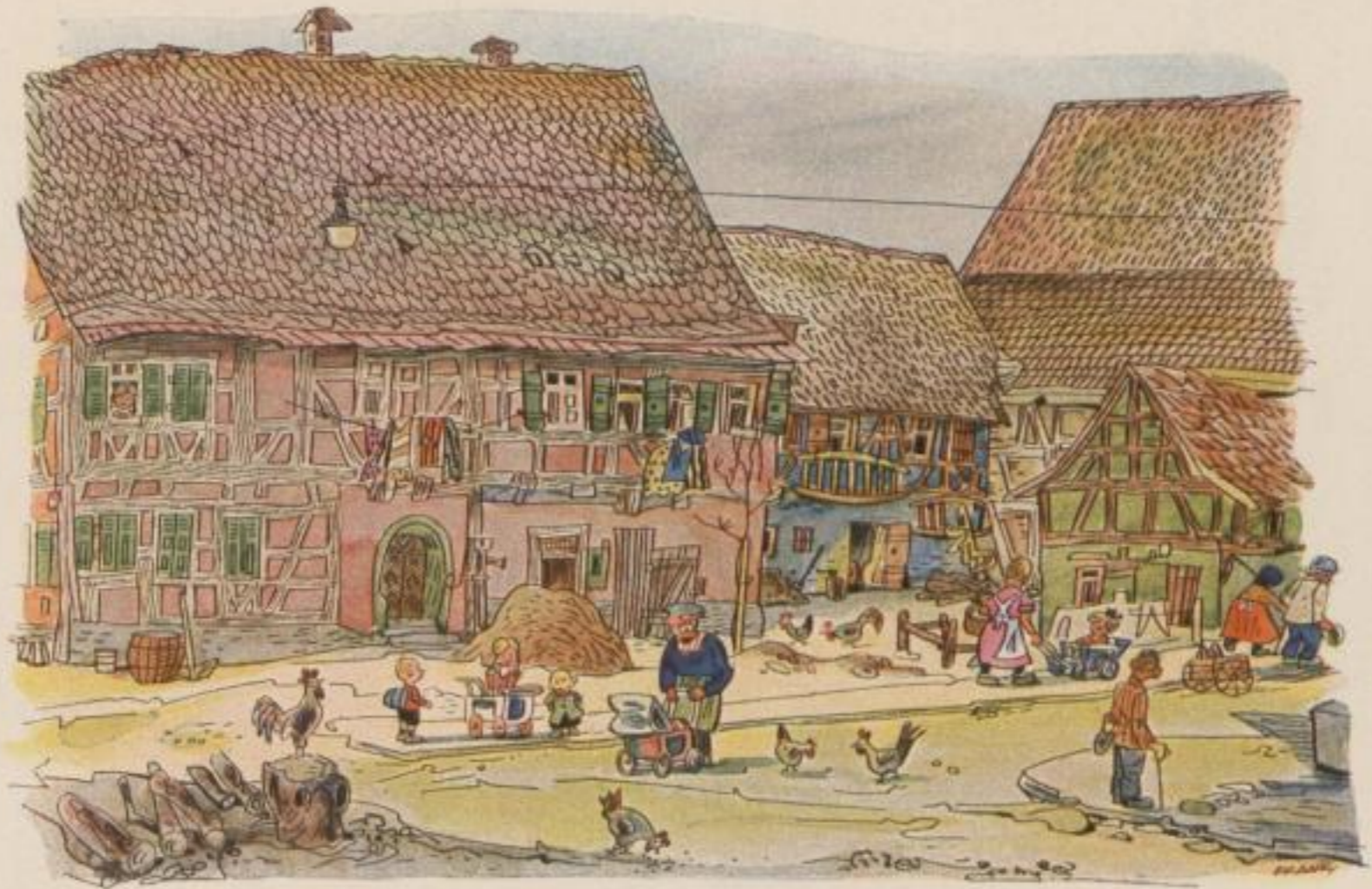
Illustrations from "Westermanns Monatsheften"