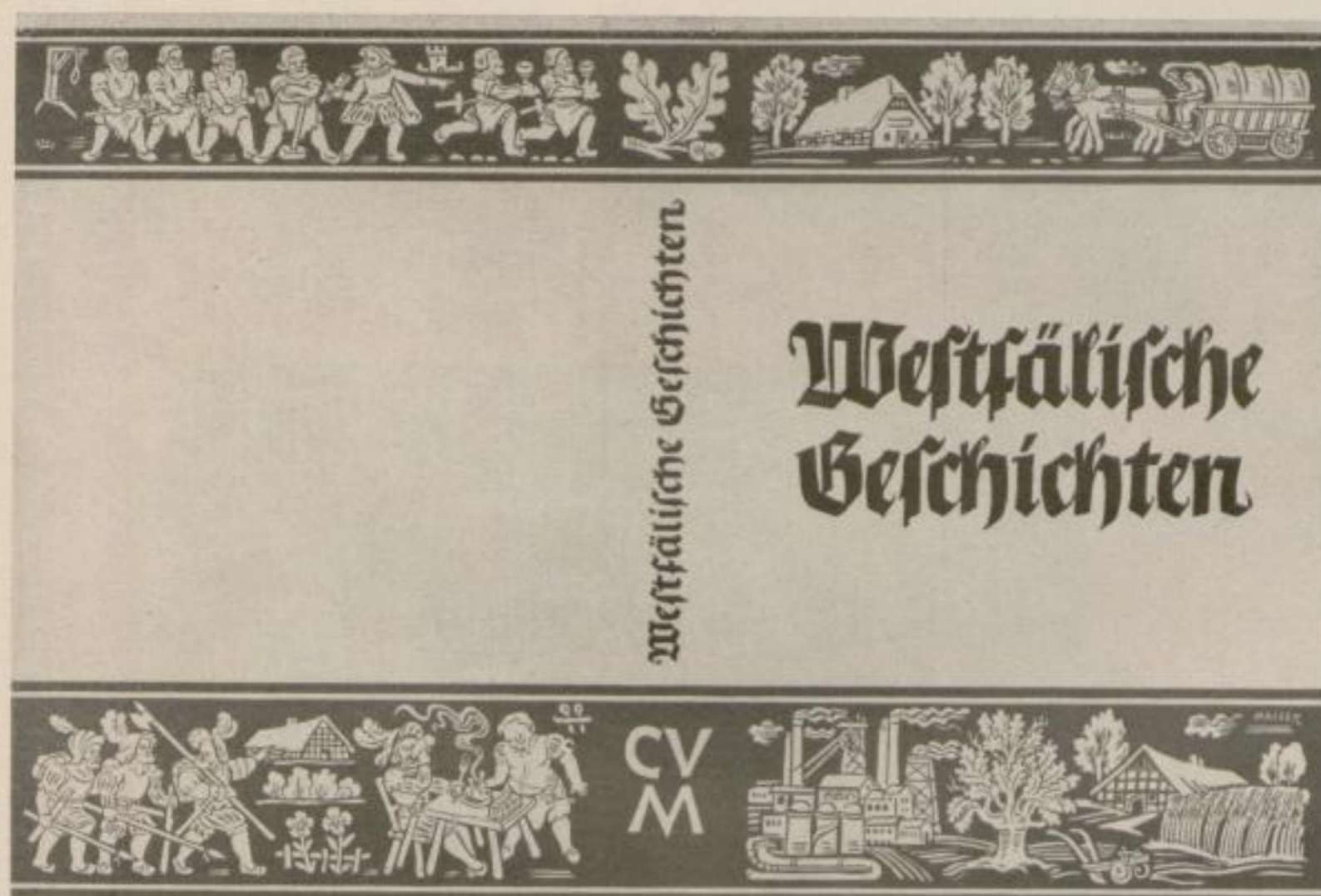
Buchumschlag Book cover