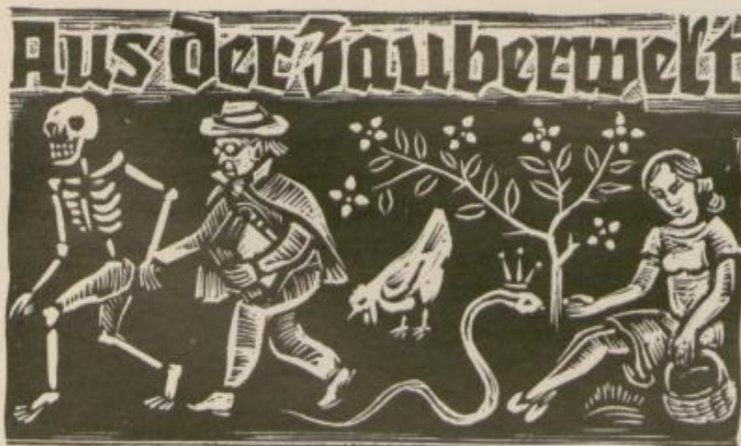
Illustrations from G. Henssen's "In de Uhlenflucht"