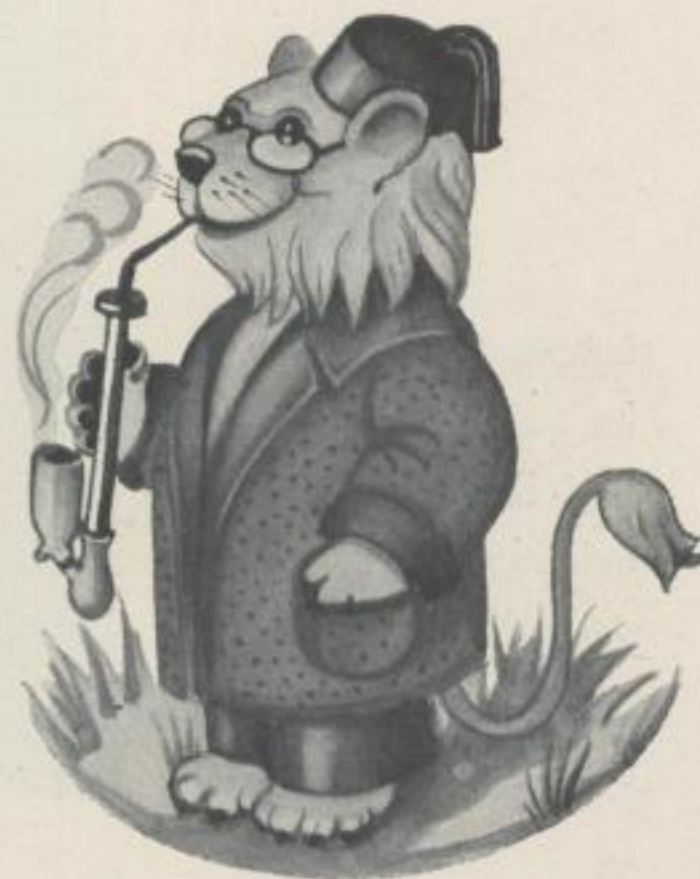
Figures taken from a picture-book