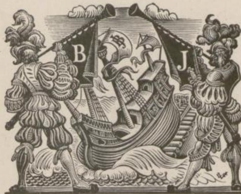
Haïratsanzeige Notification of Marriage