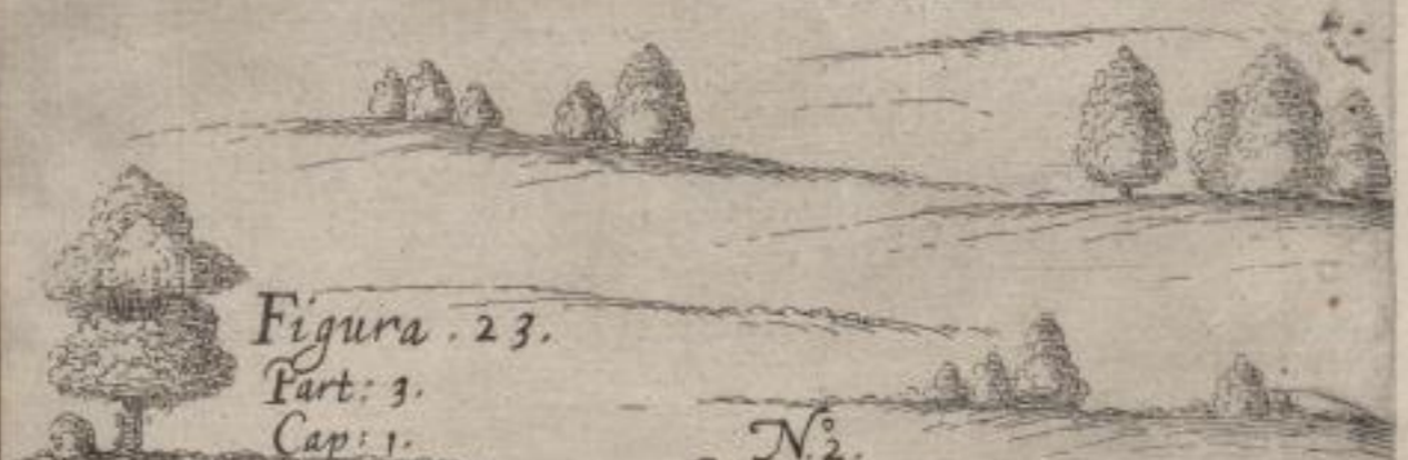
Figura . 23. Part: 3. Cap: 1.