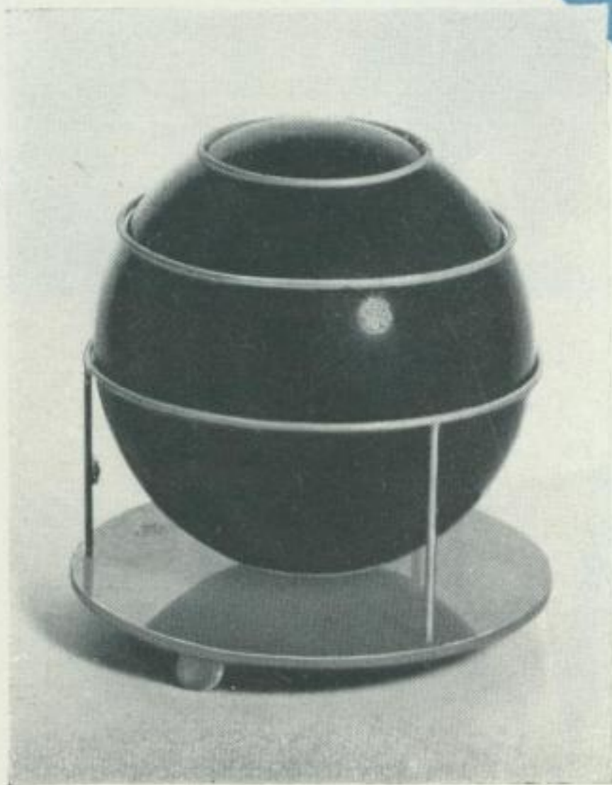
Modell 9/182 h