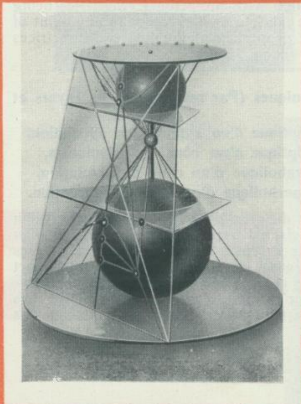
Modell 157/70 c