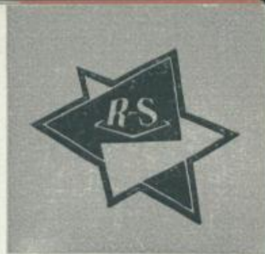
Modell 158 a/S a