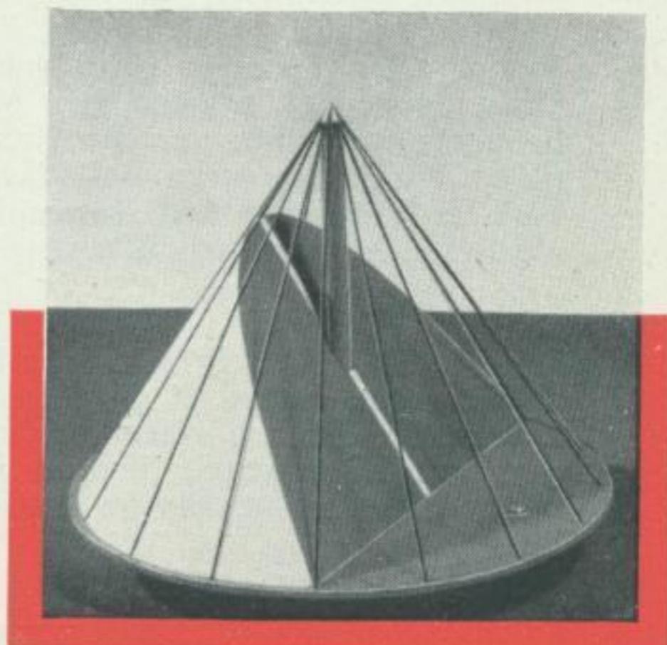
Modell 158 b/S b