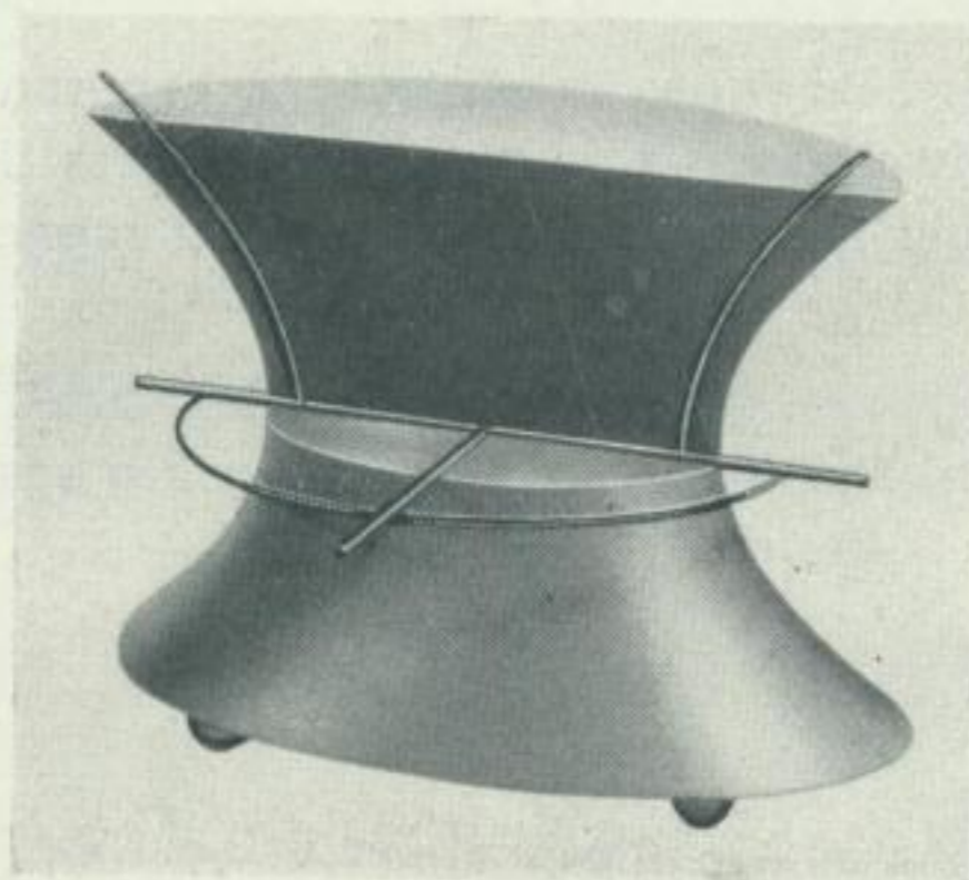
Modell 227/155 c