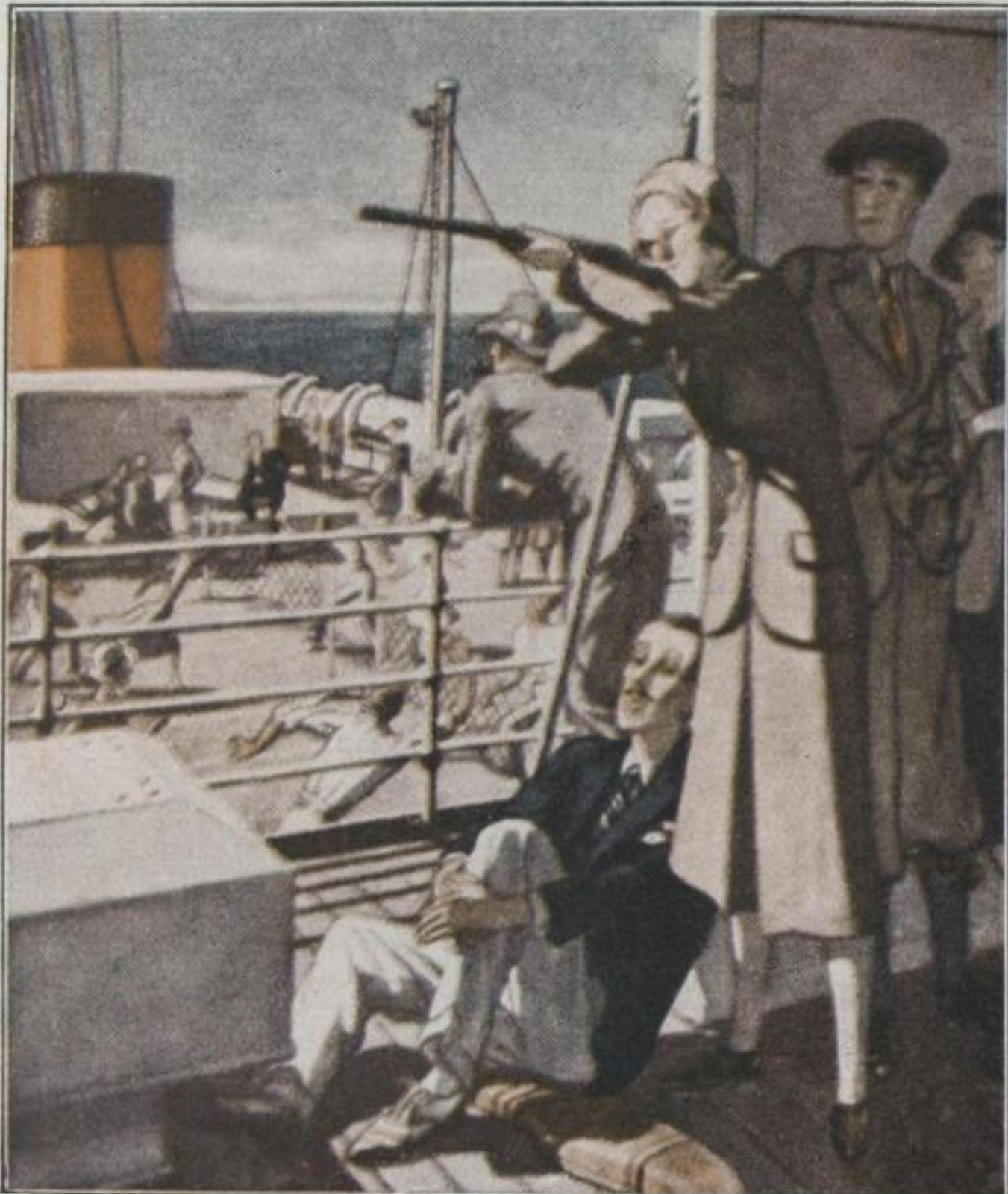
Unterwegs - vormittags