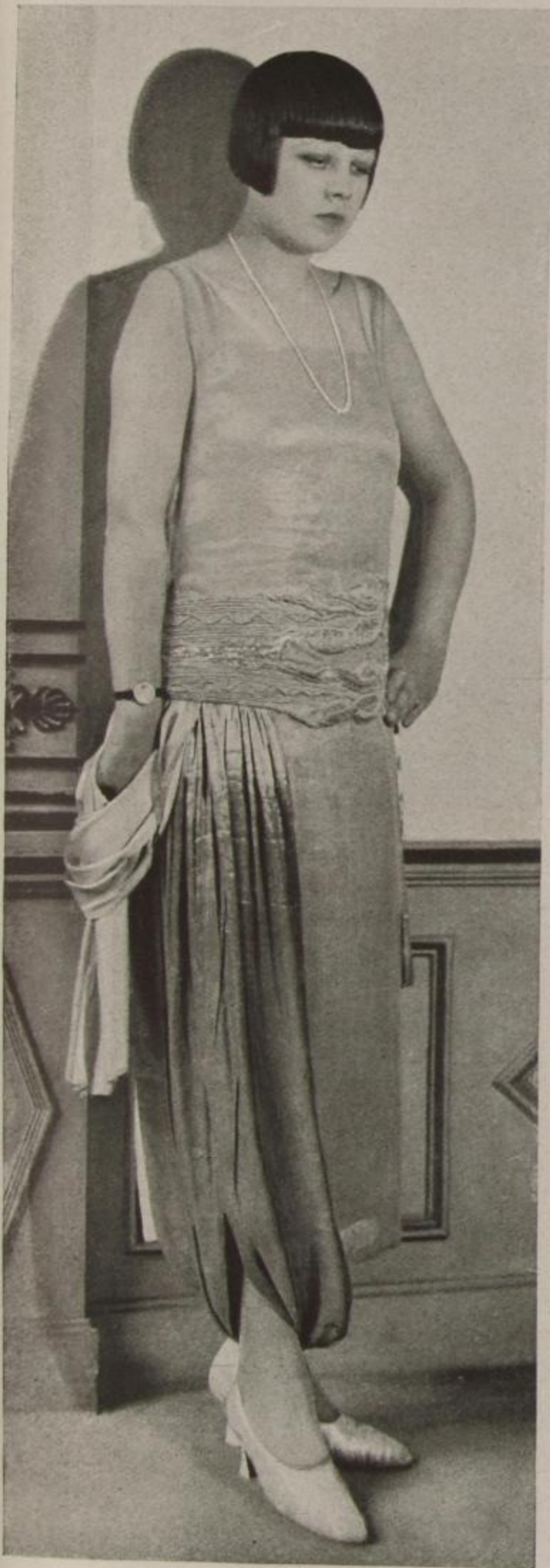
Paul Poirets neueste Modeschöpfung