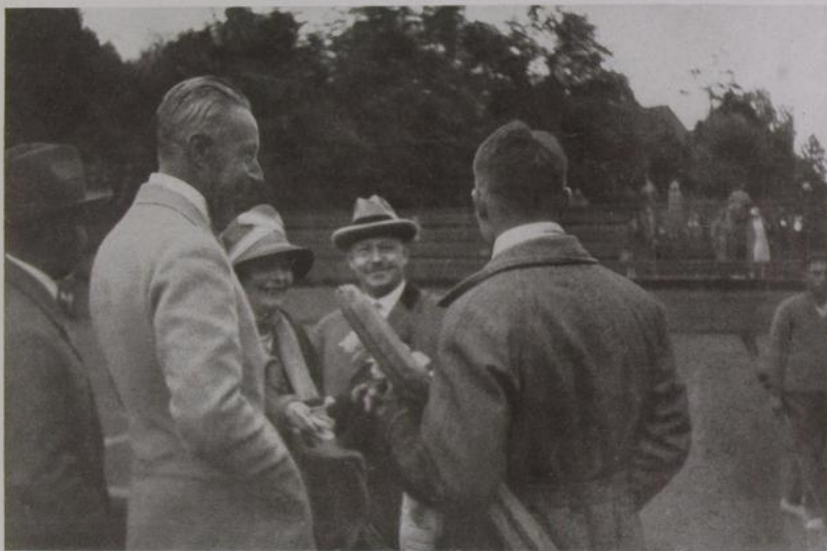
Kronprinz und Kronprinzessin