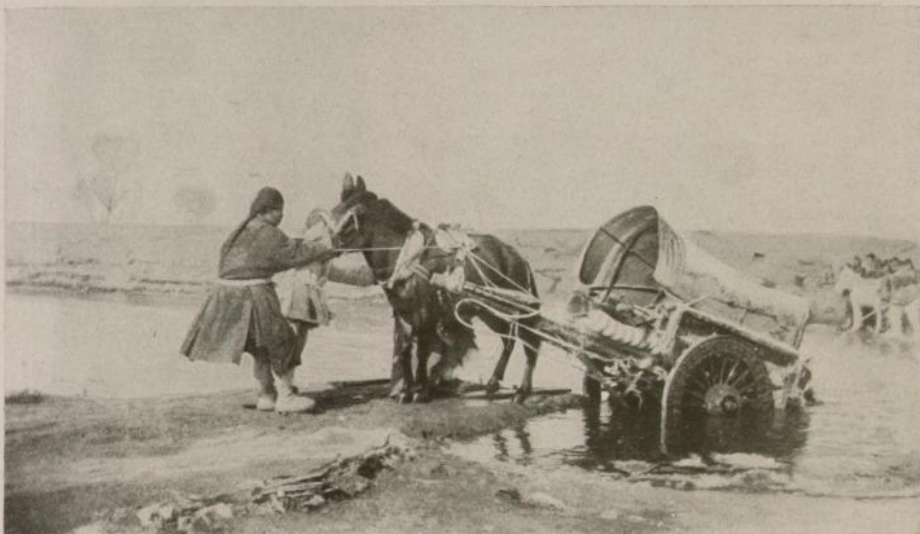
Chinesischer Karren in einer Furt