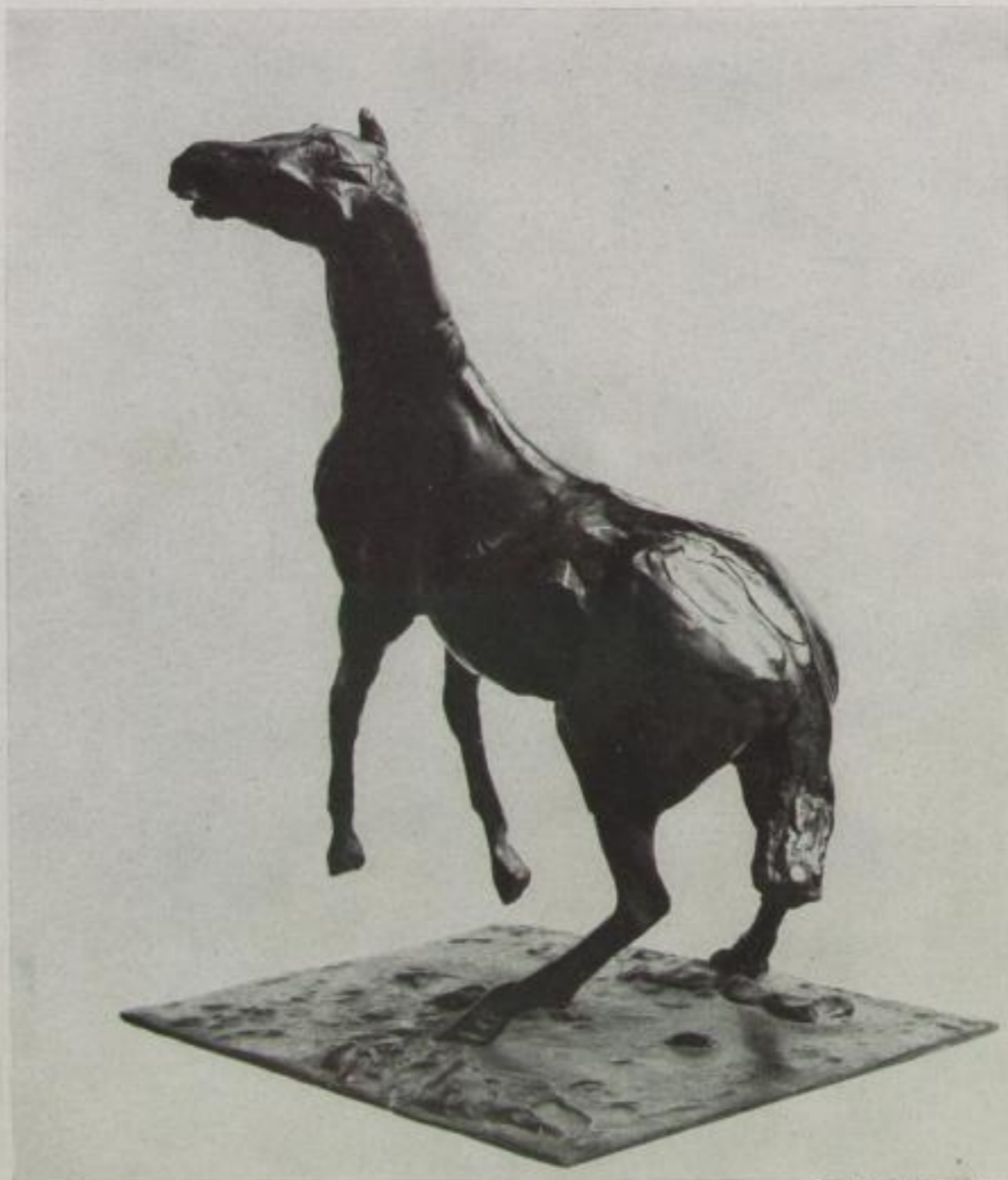
Edgar Degas, Scheues Pferd. Bronze