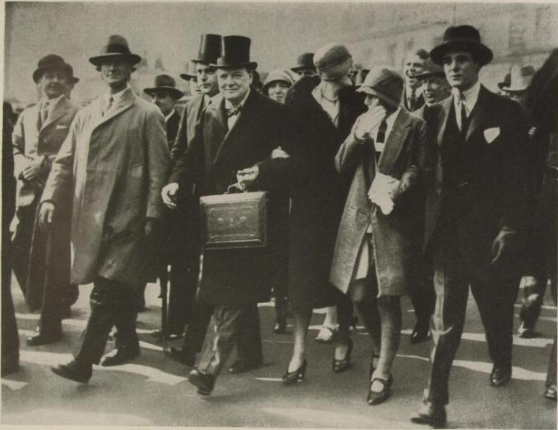
Winston Churchill mit seinem „Budget-Kofferchen“