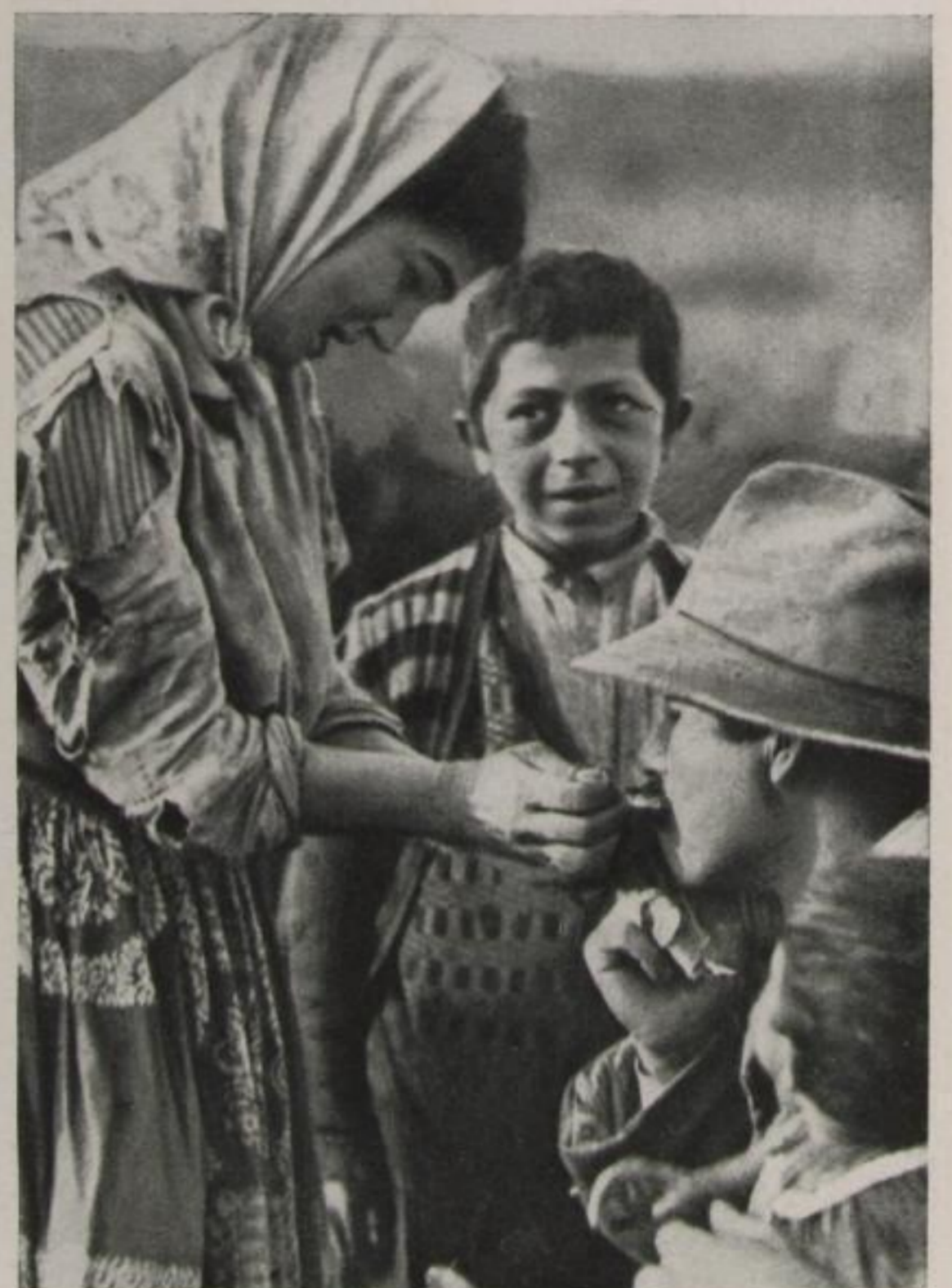
Oben: Zigeuner-Woywode und Zigeunerjunge Unten links: albanische, rechts ungarische Zigeuner