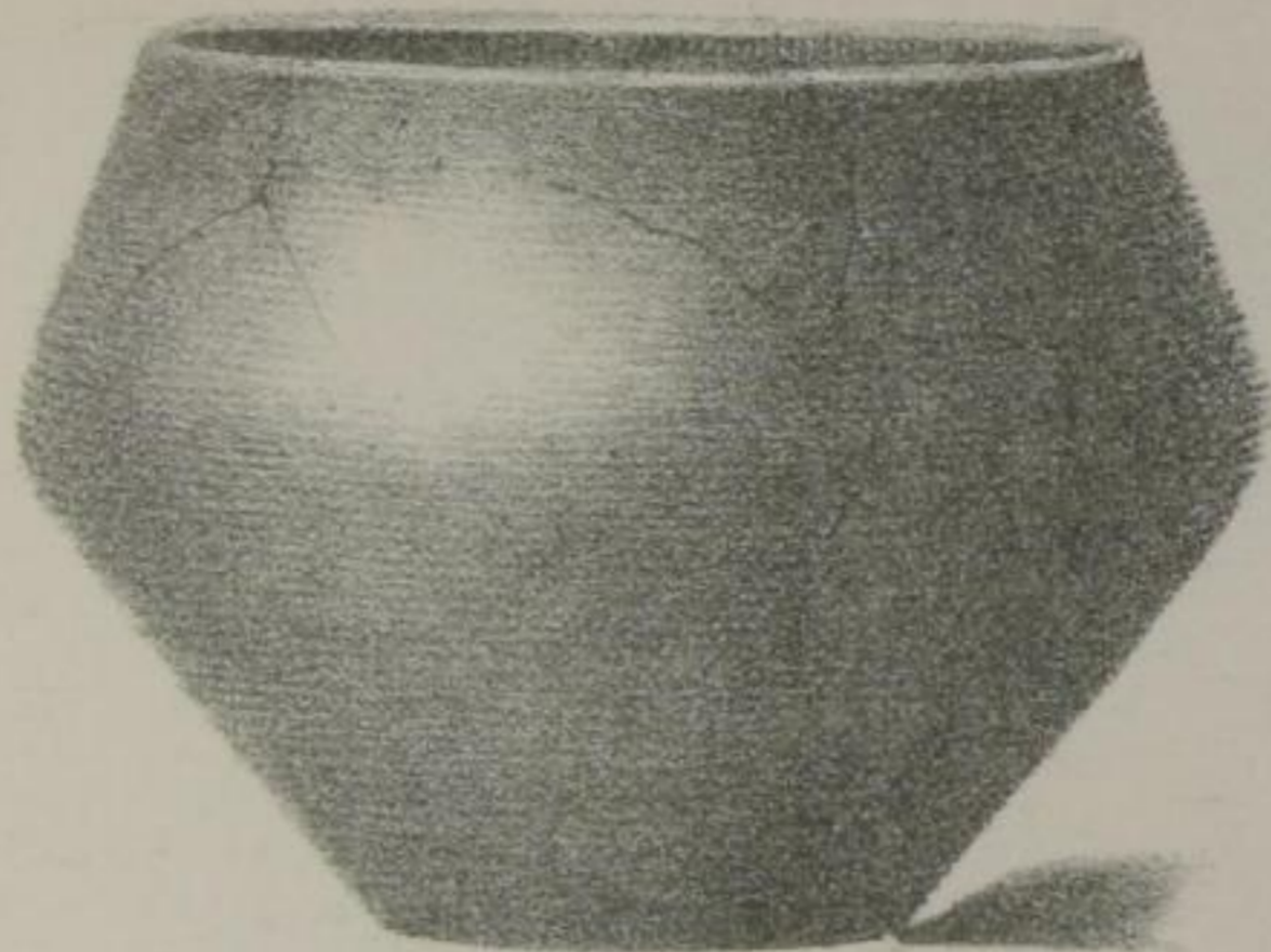
1. \frac{1}{4} Gr.