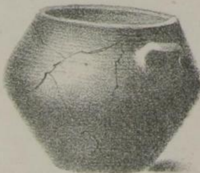
5. \frac{1}{4} Gr.