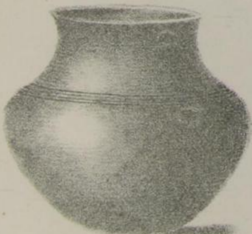
3. \frac{1}{4} Gr.