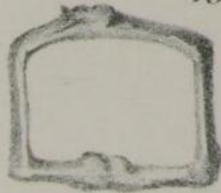
13. nat. Gr.