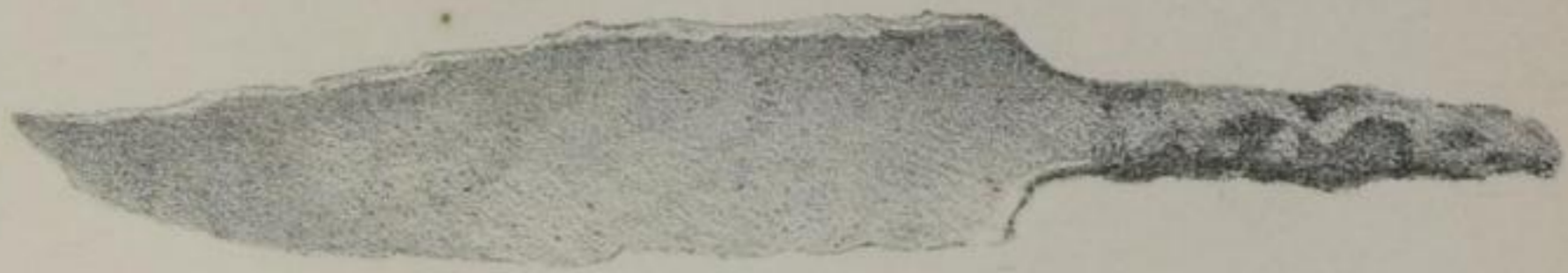
10. \frac{1}{2} Gr.