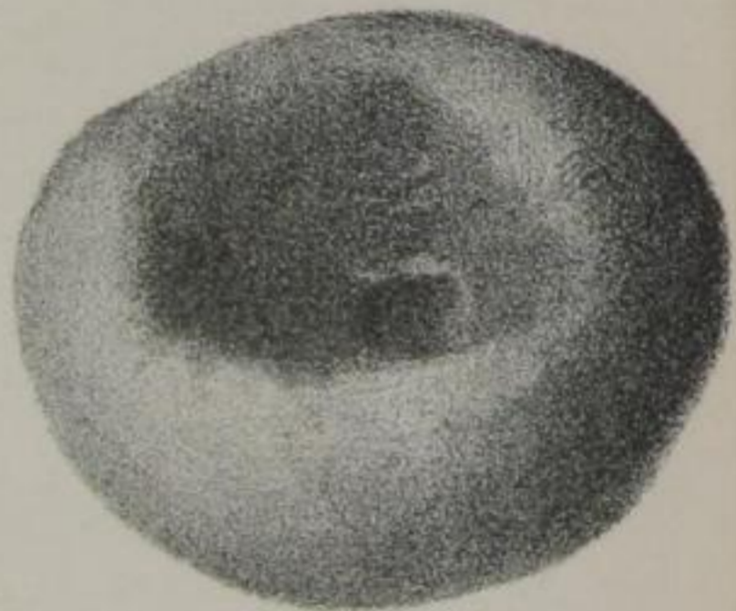
15 b nat. Gr.