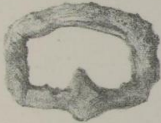
11. nat. Gr.