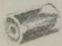
16. nat. Gr.