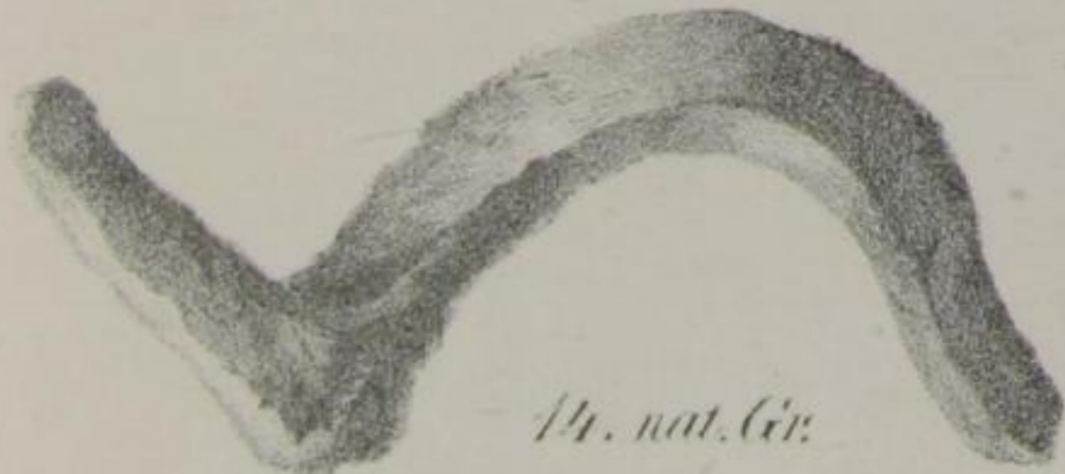
14. nat. Gr.